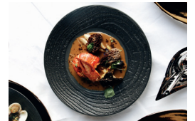
Lobster with morels